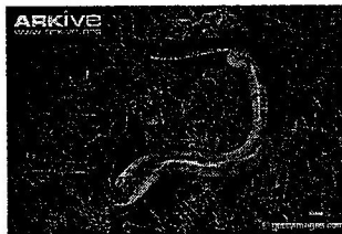
Figure 1: Earthworm

Researchers studying this species believe that the population mean length of worms of this type is less than 200 millimeters (mm). They plan to gather a simple random sample of 100 earthworms and measure each one.