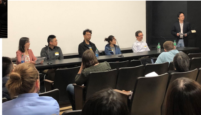
Right: Panelists discussed “Paths to Becoming a Successful Data Scientist” at the 50th Festival on April 29, 2023.